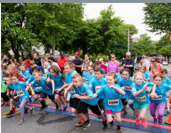
Cantina Kids Fun Run June 5, 2022