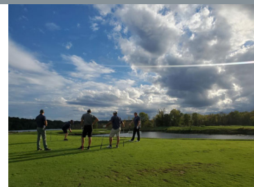
Golf Invitational September 14, 2022