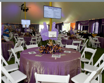
Annual Gala August 3, 2022